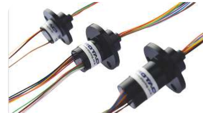
MINIATURE SLIP RINGS